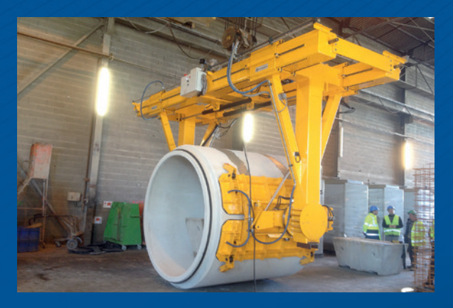
Demoulding turning beam

Moving, turning and tilting precast concrete pieces is one of ACIMEX's main fields of expertise. Its products are particularly adapted to the public construction sector.