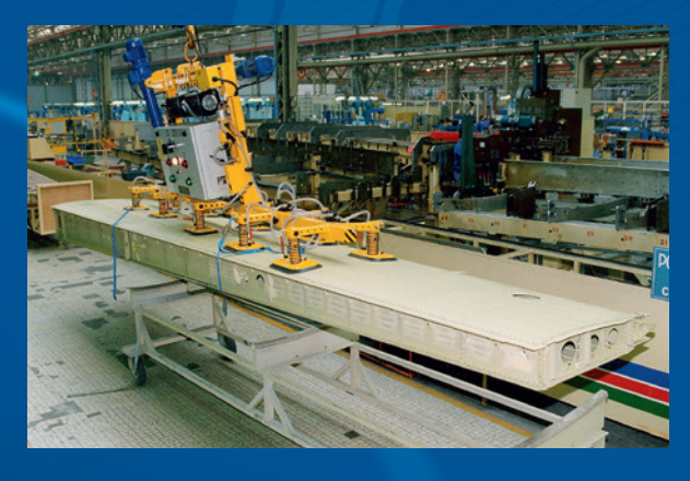
Vacuum beam for aluminium plate application

However light or heavy the metal sheet is, the vacuum beam lifts and carries it away to its final destination, while respecting the integrity of often-expensive products.